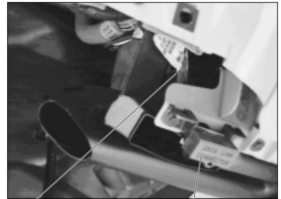
Locate PTO Circuit Wire