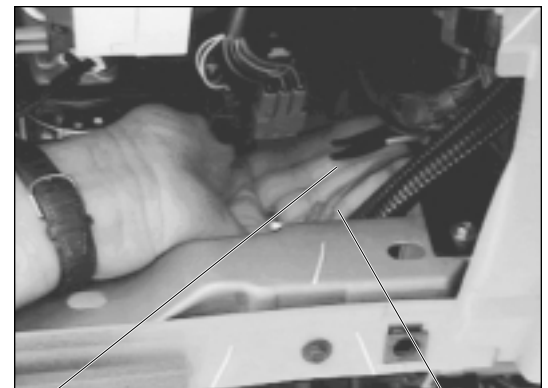
Body Builder Pass-Through